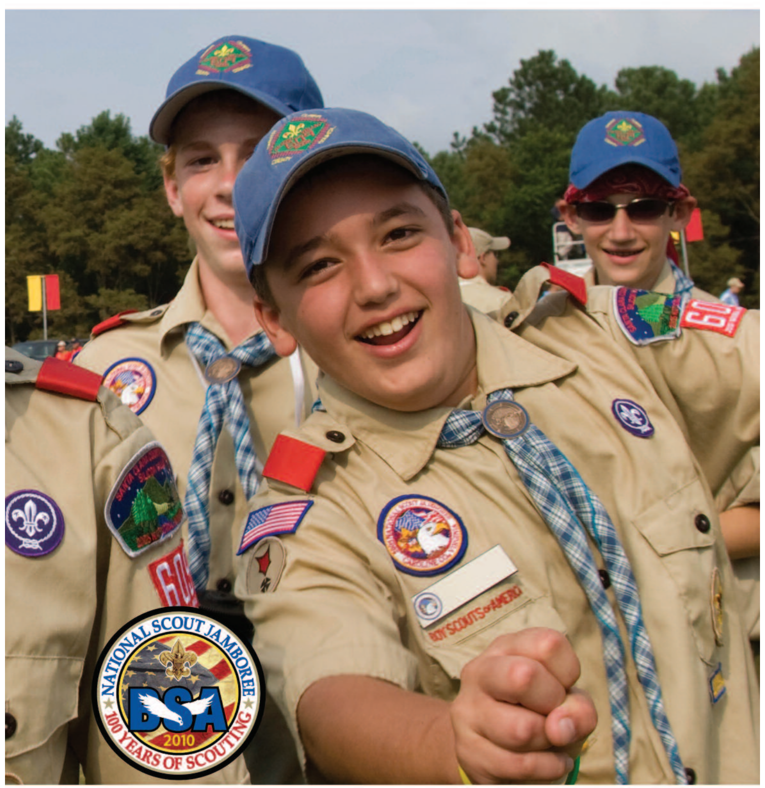
JULY 26-AUGUST 4, 2010 FORT A.P. HILL, CAROLINE COUNTY, VIRGINIA

2010 NATIONAL SCOUT JAMBOREE BOY SCOUTS OF AMERICA